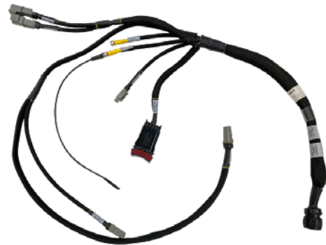
System Control Harnesses