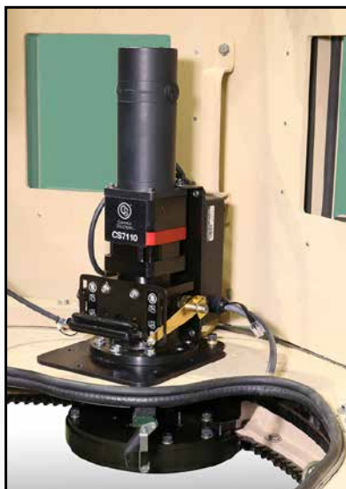
CS7110 Installed on M1151 Style Turret.

Control Solutions LLC has designed and manufactured field-hardened systems to meet the challenges of the military for over 20 years. Control Solutions LLC, your rapid-response provider of motion control solutions.