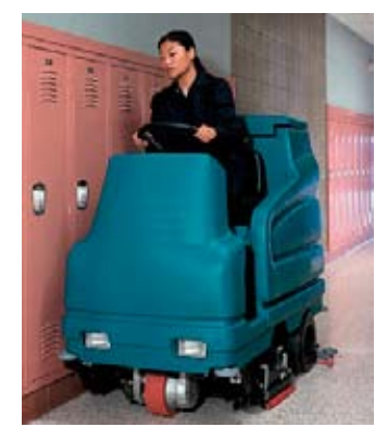
CS1320A keeps staff and expensive equipment safe from injury or damage

In many cases, ride-on operators of equipment are