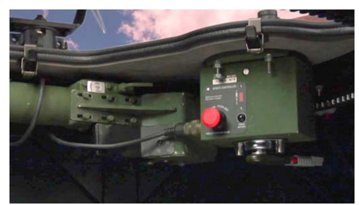
CS3208 TCS Motor Control and Drive Assembly

Designing and manufacturing field-hardened systems to meet the challenges of the military for over 20 years. Control Solutions LLC, your rapid-response provider of motion control solutions.