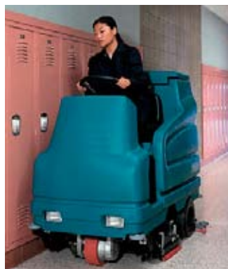
CS1320A keeps staff and expensive equipment safe from injury or damage

In many cases, ride-on operators of equipment are